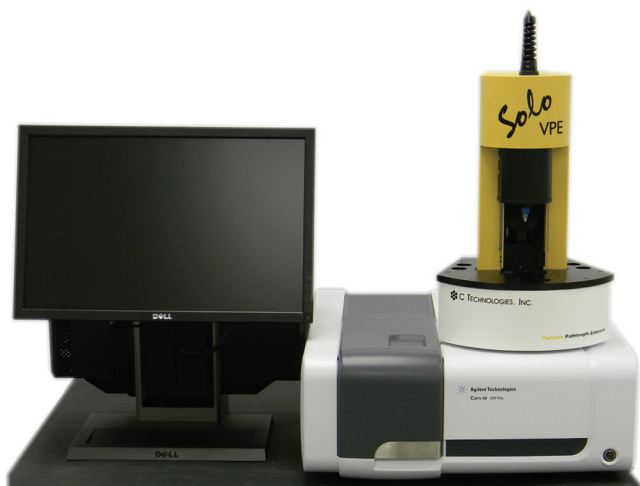
SoloVPE system by C Technologies, Inc. ( http://solovpe.com )

Because there is no sample manipulation and the SoloVPE System is at its core a UV technique, validation of the instrument and methods is straightforward. The same SoloVPE method can be used across analytical and process development, quality control, and manufacturing. Once the system is implemented on the manufacturing floor, the need to send STAT UV samples to QC for in-process testing is eliminated.